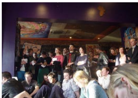
Almost standing room only at the Almanac launch

est when it's in the car on the way home from the bookshop. We know because it told us, so if you haven't got a copy, lob on down to your local and if it's not there, order it, or just hop onto our site and order it at www.sleeperspublishing.com .